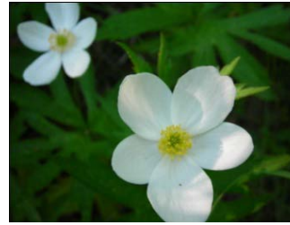
Meadow Anemone ( Anemone canadensis )