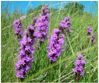
Dotted Blazing Star ( Liatriis punctata )