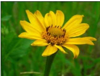
Maximilian sunflower ( Helianthus maximilianii )

Habitat: Ditches, disturbed sites, roadsides