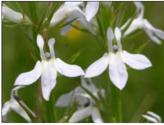
Palespike Lobelia ( Lobelia spicata )