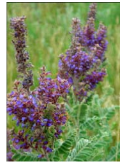
Lead Plant ( Amorpha canescens )