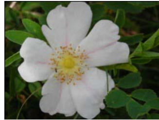
Prairie Rose ( Rosa arkansana )