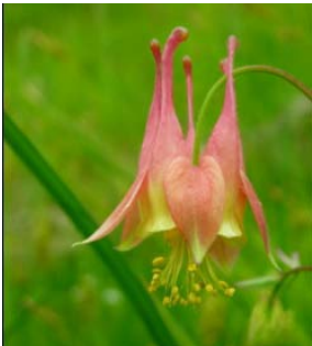
Wild Columbine ( Aquilegia canadensis )