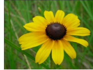
Black-eyed Susan ( Rudbeckia hirta )

Comment: North Dakota plant species of concern