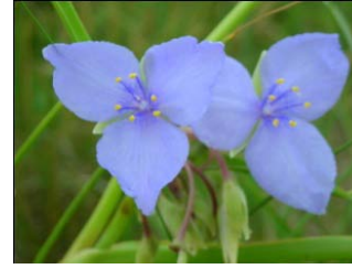
Spiderwort ( Tradescantia bracteata )

Habitat: Prairies, along streams, open woodlands