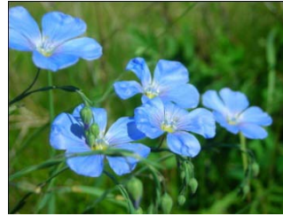
Blue Flax ( Linum perenne var. lewisii )