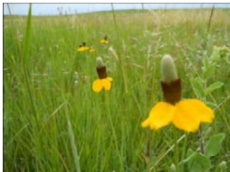
Prairie Coneflower ( Ratibida columnifera )

Habitat: Prairies, thickets, along streams