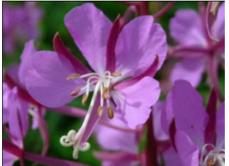
Fireweed ( Chamerion angustifolium (L.) Holub.)

Habitat: Prairies, ditches, open woodlands