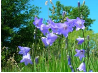
Harebell ( Campanula rotundifolia )