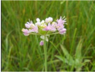
Pink Wild Onion ( Allium stellatum )