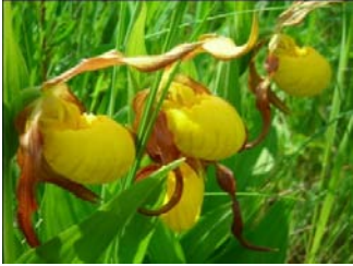
Yellow-lady's Slipper ( Cypripedium calceolus )