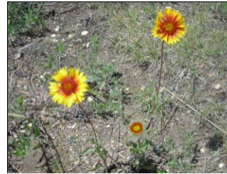
Blanket Flower ( Gaillardia pulchella )