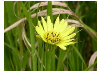
Goats' Beard ( Tragopogon dubius )

Habitat: Prairies, thickets, along streams, roadsides