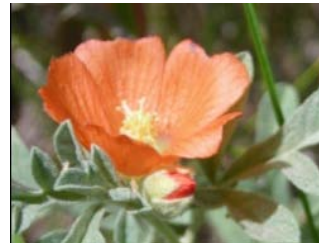
Scarlet Mallow ( Malvastrum coccineum )